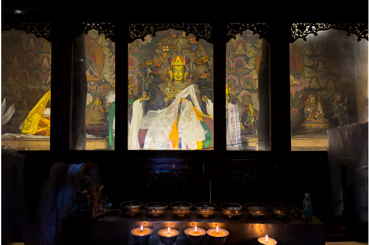
Figure 1: The Main Shrine during lighting test in early July.