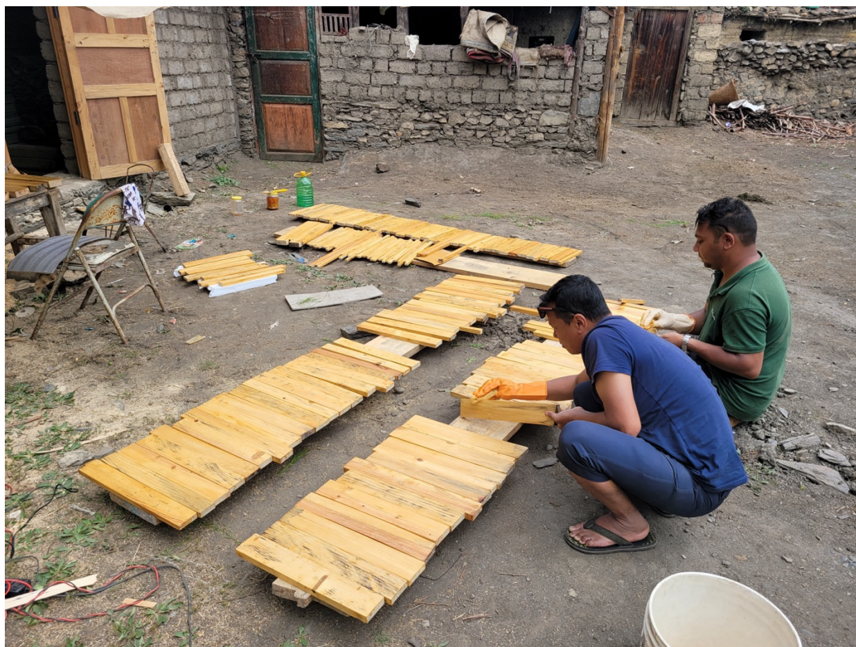
Figure 2: Carpenters applying a coat of shellac polish to the prefabricated wooden pieces in Jharkot office.

last year. The wooden frames constructed in the previous year provide the necessary support and hold the stone panels in place.