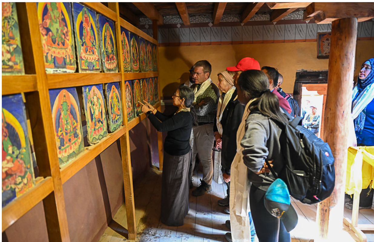
Figure 3: Members of the US Embassy examining the installation of the stone panels in the Guru Lhakhang.