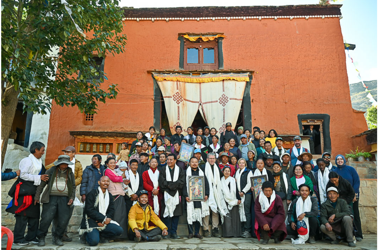
Figure 1: Group photo at the occasion of the closing ceremony at Lo Gekhar.