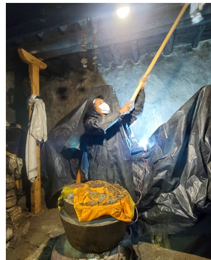
Figure 8: The soot covered walls of the protector deity room before cleaning and painting.