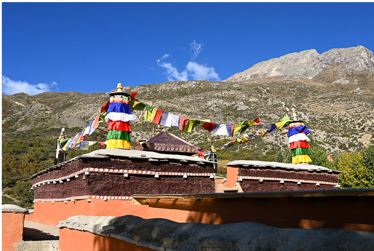
Figure 7: The temple roof after replacing the cloth of the victory banners.