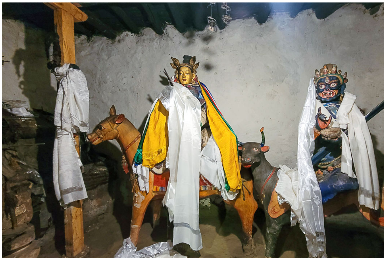
Figure 10: The protector deity walls after the cleaning and fresh paint. The image also shows the old column replaced with a new square one.