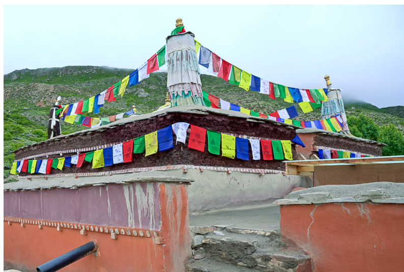
Figure 5: The temple roof with the worn-out cloth on the victory banners.

Further, the fabric of three victory banners on the roof had worn out and was replaced with new ones purchased from Kathmandu.