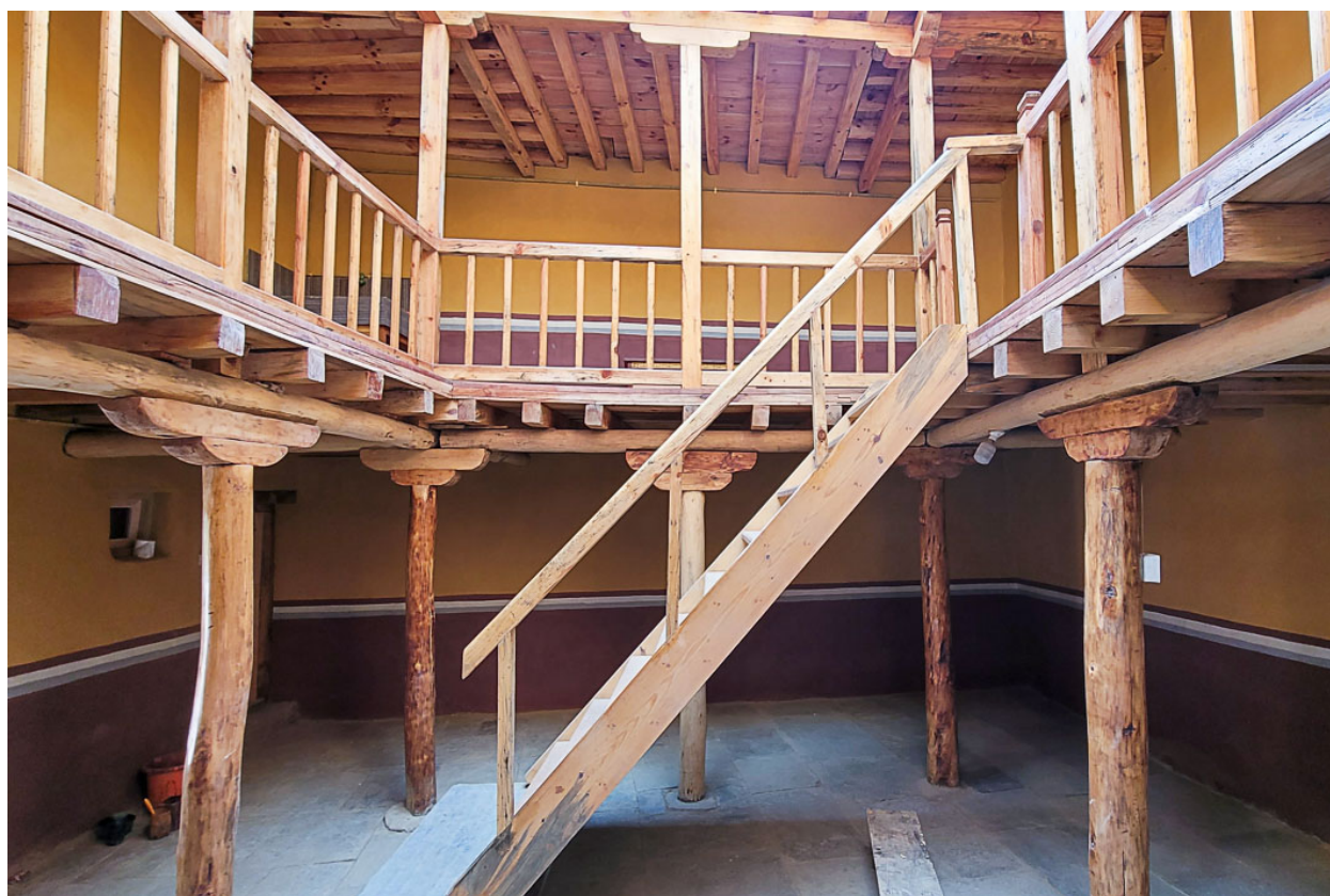
Figure 11: The wooden staircase leading to the upper floor in the caretaker's residence completed with a wooden rail.

A wooden staircase in the caretaker's atrium leading to the upper floor was originally conceived without handrails. However, it was suggested afterwards to add a handrail to the stairs to assist the elderly during their visits. Once added, the handrail was sanded and linseed oil was applied to complete it.