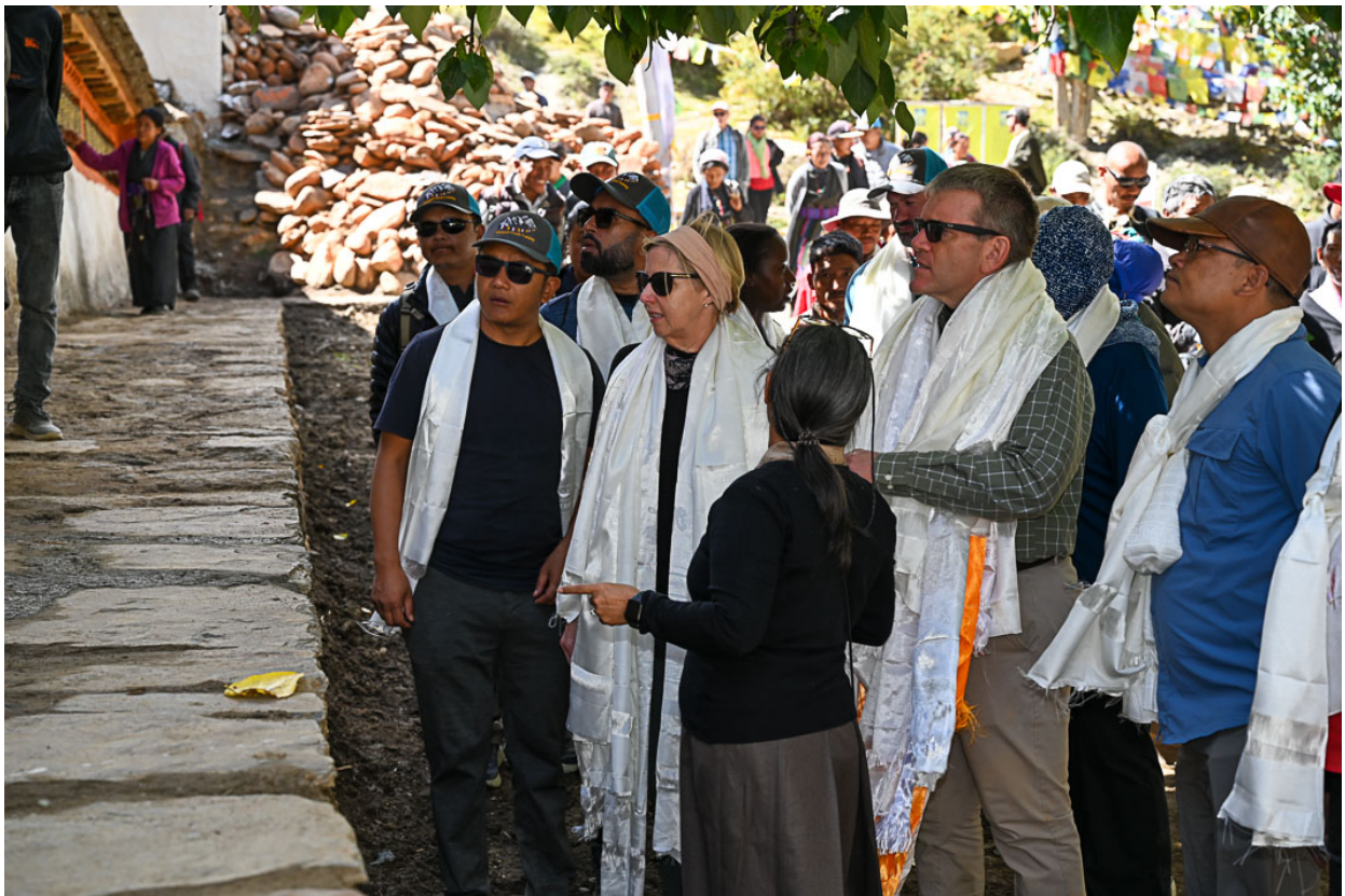
Figure 2: The US Embassy delegation inspecting the work along the circumambulation path.