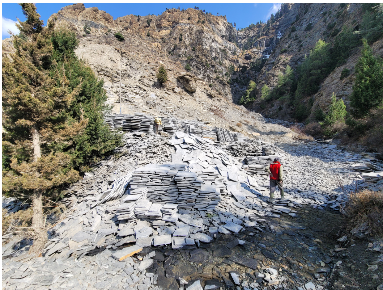
Figure 2: The flagstone quarry in Chhairo, Marpha.