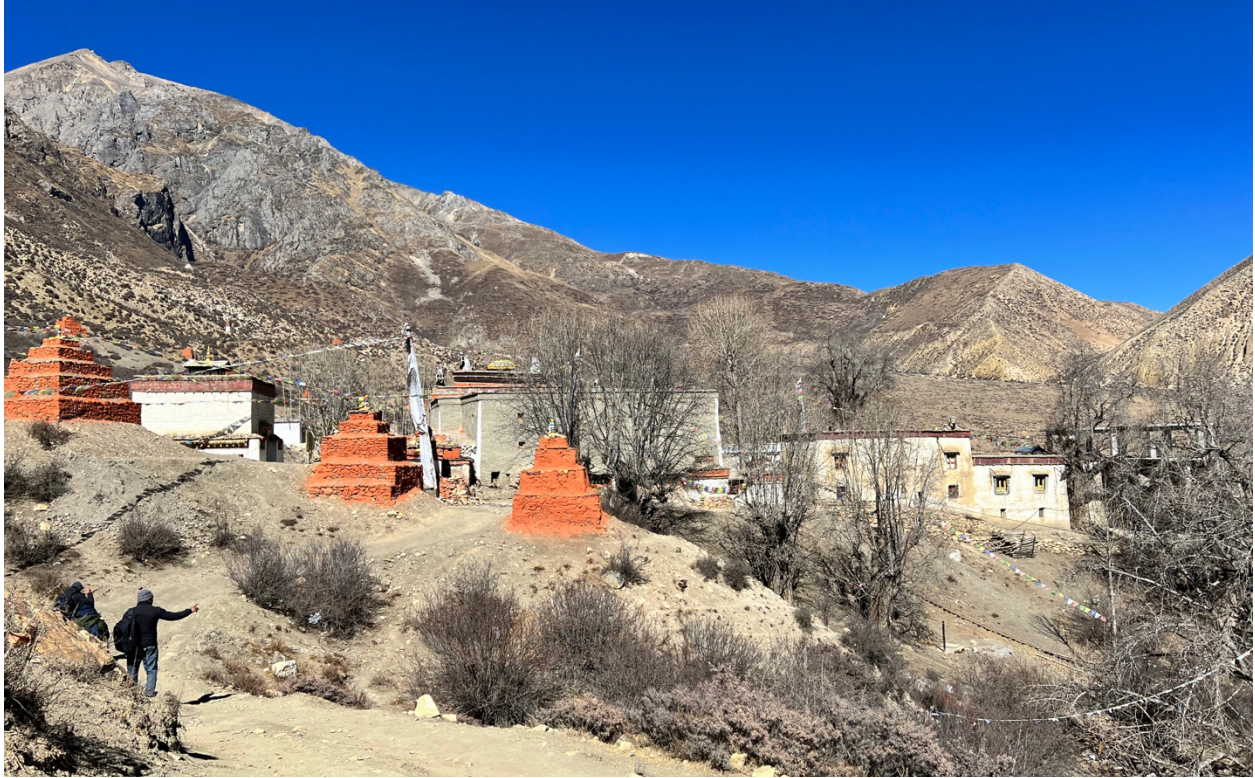
Figure 1: View from the back of the temple with the caretaker's mansion restored to the roof.